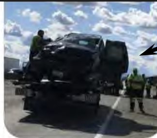
The other car!