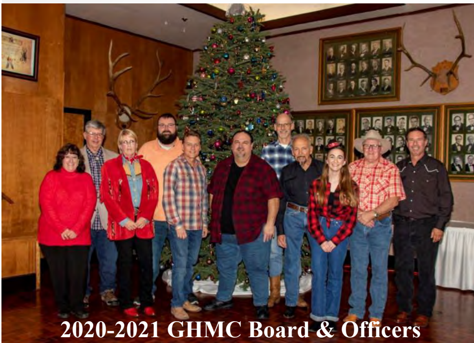
2020-2021 GHMC Board & Officers